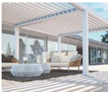
MOTORIZED ADJUSTABLE PERGOLAS

SUNAIR AWNINGS AND PERGOLAS OFFER ENDLESS POSSIBILITIES AND ARE THE ULTIMATE PROTECTION FOR YOUR PATIO OR DECK.