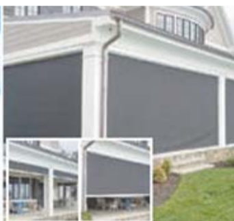
ROLL DOWN BUG SCREENS