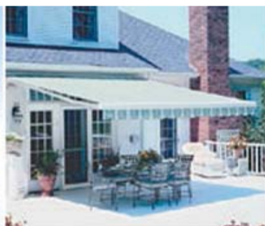
RETRACTABLE PATIO AWNINGS